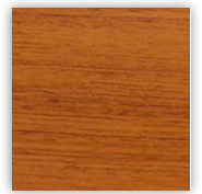
BRAZILIAN CHERRY WOOD GRAIN LAMINATE

Special formula PVC never needs painting, makes cleaning a snap, and prevents scratching and denting.