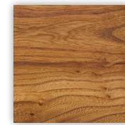
MEDIUM OAK WOOD GRAIN LAMINATE